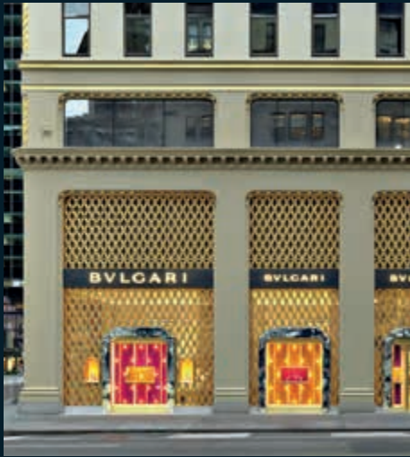
— Bvlgari, New York