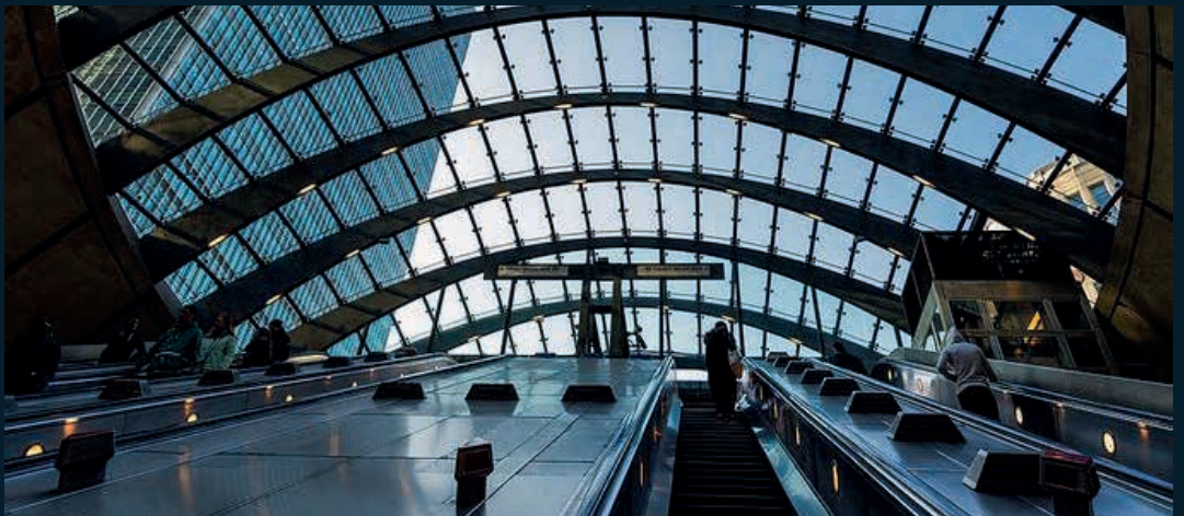
— Canary Wharf Station, London

Our advanced laminated glazing incorporates acoustic insulation, UV protection and impact resistance, enabling designs that balance elegance, functionality and durability.