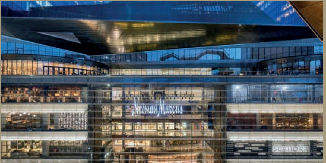
— Neiman Marcus Hudson Yards, New York