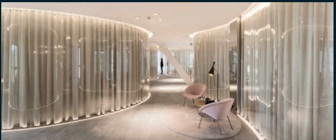
— Natixis Group, Paris

Isoclima is shaping the future of architectural design through solutions that blend sustainability, innovation and reliability. From low-emissivity coatings to lightweight materials that reduce environmental impact, our products reflect a purpose-driven commitment to crafting a better world. With every project, we provide 360-degree support to simplify complexities, anticipate challenges and deliver with exceptional care. At Isoclima, we don't just provide glass—we enable transformative designs that inspire and endure.