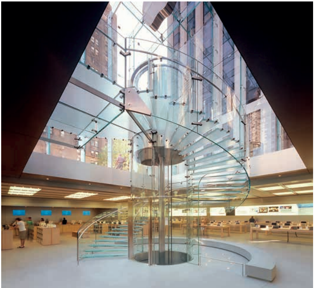
— Apple Store, New York

By integrating solar control, optical clarity and structural durability , we provide architects with the freedom to create iconic, safe and sustainable spaces . Our commitment to excellence ensures that every project benefits from precision engineering and cutting-edge materials , delivering both aesthetics and performance.