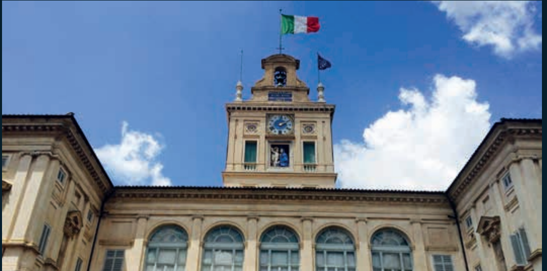
— Palazzo del Quirinale, Rome