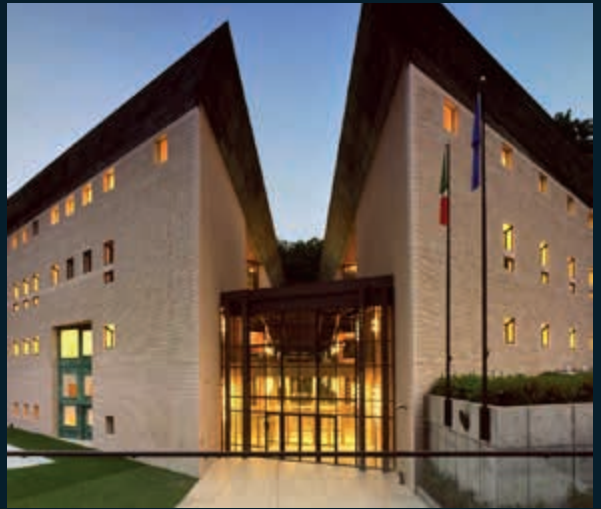
— The Embassy of Italy, Washington