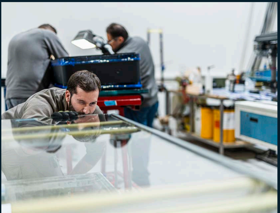
— Isoclima glass processing

Isoclima's reputation is built on a foundation of trust, precision, and innovation. Our co-engineering processes allow us to partner with the world's top automotive brands, including Stellantis, Mercedes-Benz, BMW, and VW-Audi Group.