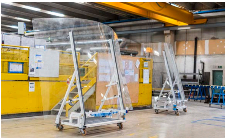
— Isoclima glass processing