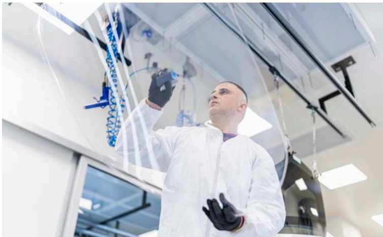
— Isoclima glass processing

Unified by a wealth of cross-sector knowledge and cutting-edge technologies, our solutions stand out for their ability to balance sophistication and function.